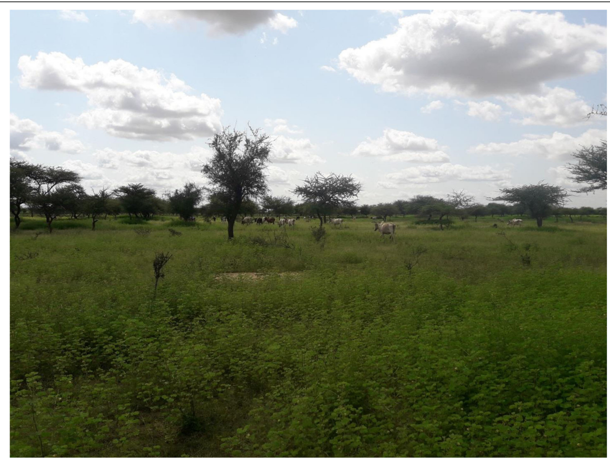
Fig. 3 Stands of Senna obtusifolia in the pastoral zone of Ceekol Nagge

as soon as the first rains fall, animals start grazing it because they have no choice. That's it! So that's a bit like that. Animals have been accustomed to the diet, especially the sheep (Researcher at INERA, 50 years old, Ouagadougou on 19/10/2018).