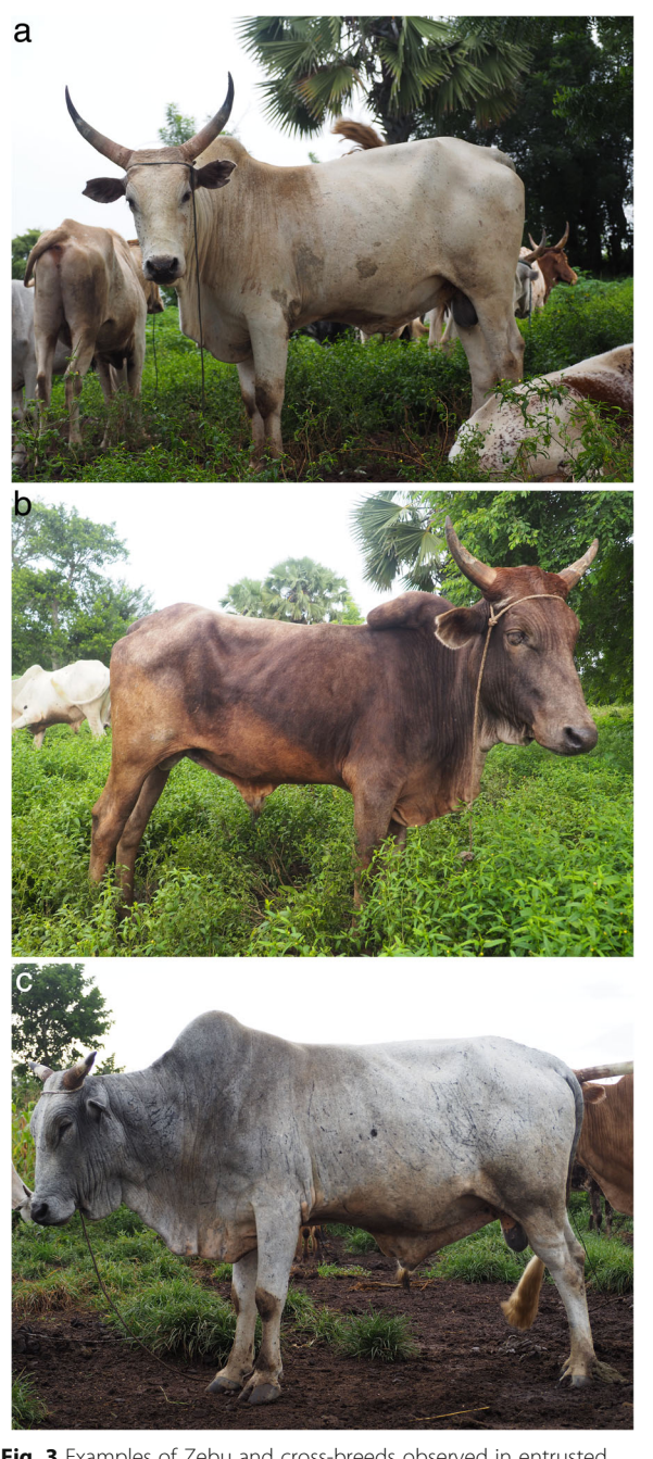
Fig. 3 Examples of Zebu and cross-breeds observed in entrusted herds. a White Fulani bull. b Zebu Azawak. c Goudali cross-breed

Firstly, exploratory bivariate analyses were carried out using chi-square and Mann-Whitney U tests to compare absentee-owners who entrust their cattle to herders and owners who were managing themselves their cattle herds. The investigated variables included the socioeconomic characteristics of the household head (age, sex, educational level, ethnicity), the type and extent of labour in the household (main activity and source of income, size of the household, cultivated land size, number of owned animals from other species), acquisition mode and characteristics of cattle herds (animal age, sex and breed composition). Subsequently, variables that showed significant differences between the two groups of farmers were considered as potential predictors and submitted to a binary logistic regression analysis using a backward stepwise elimination procedure (Hair et al. 2006) to assess factors influencing farmers' decision to entrust their cattle. The dependent variable (cattle entrustment) is dichotomous and can take the value 1 (yes) with a probability of success y, or the value 0 (no) with a probability of failure 1-y. Independent variables or predictors are categorical or continuous. The analysis began with the full model (Eq. 1) that included all potential predictor variables. Variables that were not significant in